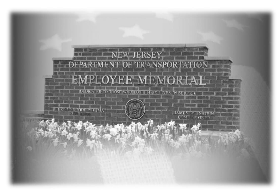
New Jersey Department of Transportation